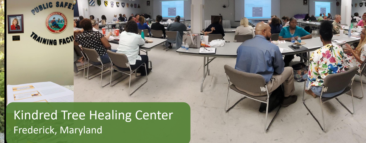
Kindred Tree Healing Center Frederick, Maryland