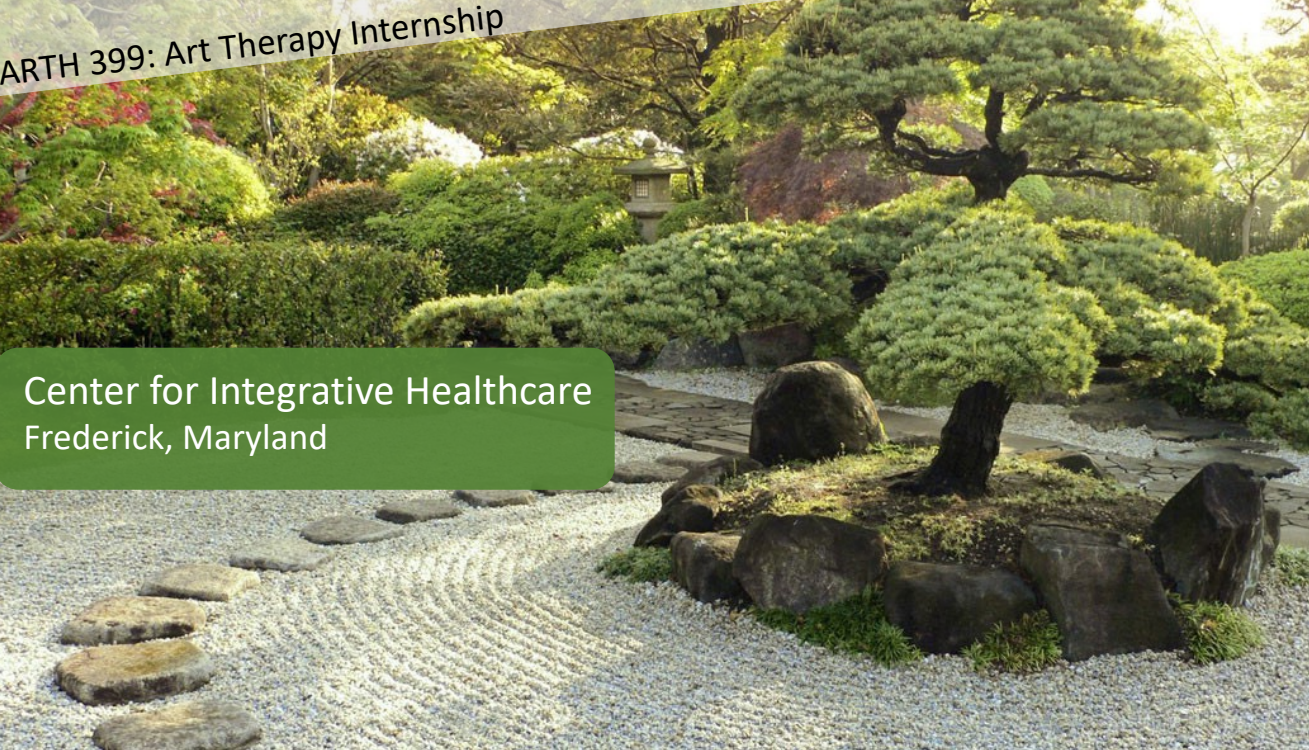
Center for Integrative Healthcare Frederick, Maryland